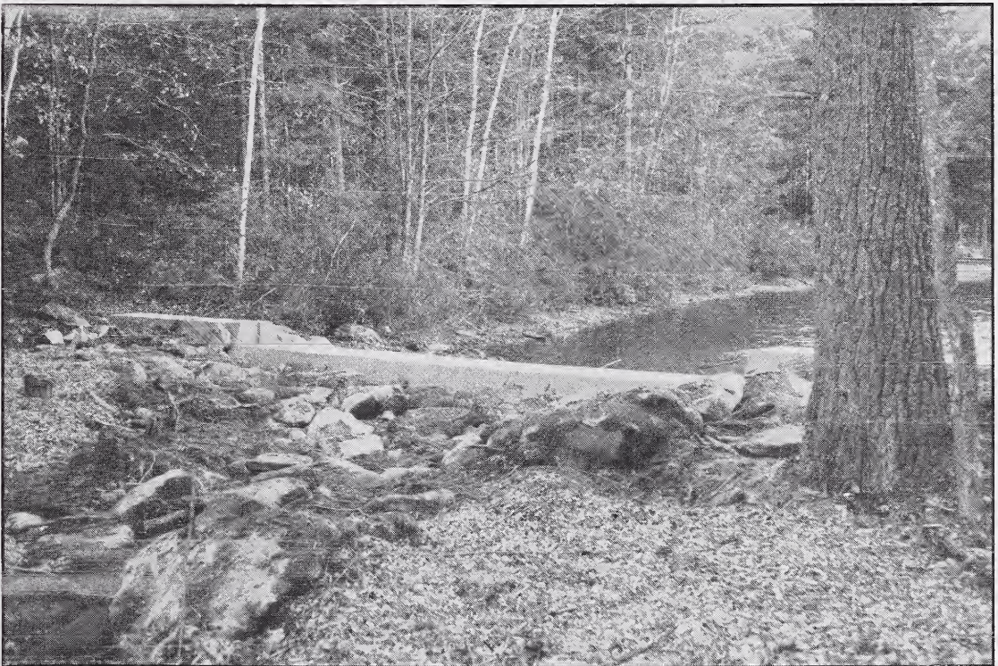
Ledge Pond Dam